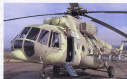
35 Mi171s and Mi-171Shs at a cost of US$210 million.

It has been reported that Russia will export five Mi-171 transport helicopters to the Iranian Red Crescent Society in 2009. The Ulan-Ude aircraft building plant that produces the Mi-171 and Mi-171Sh signed the agreement at the end of 2007. Earlier in the year, the same plant supplied Iran with